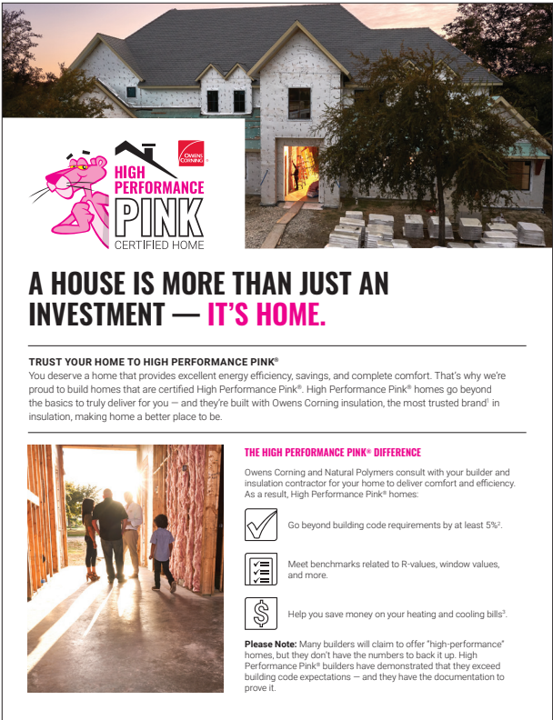
Homeowner-facing sell sheet