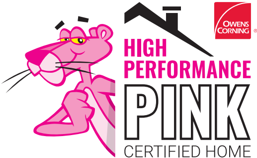
High Performance Pink Certified Home window cling