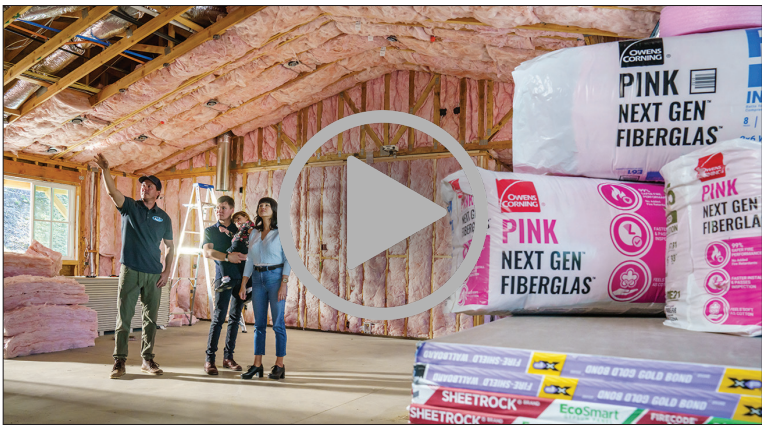
Homeowner-facing video available to embed