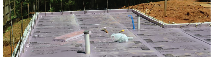
Boards should be installed tightly together.