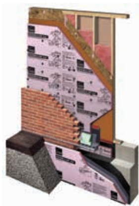
The CavityComplete ® Wood Stud Wall System excludes the masonry veneer, wood studs, interior gypsum board and exterior sheathing. A detailed list of the components is available at www.CavityComplete.com .