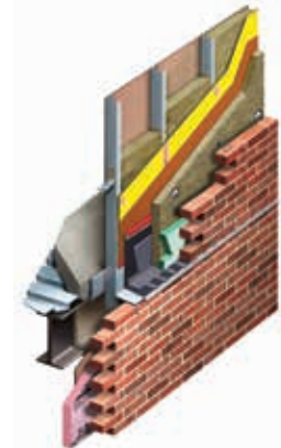
The CavityComplete ® Wall System excludes the masonry veneer, steel studs and interior and exterior gypsum board. A detailed list of the components is available at www.CavityComplete.com .